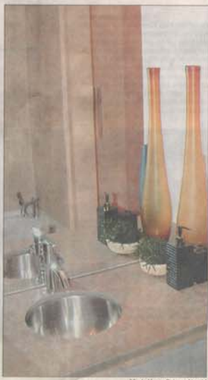
The main bath and ensuite have elegant-looking travertine tile on the walls and floors, and limestone vanities.

There will be heated and secured underground parking as well as 70,000 square feet of retail and commercial space and street-level townhouses to complete the total project.