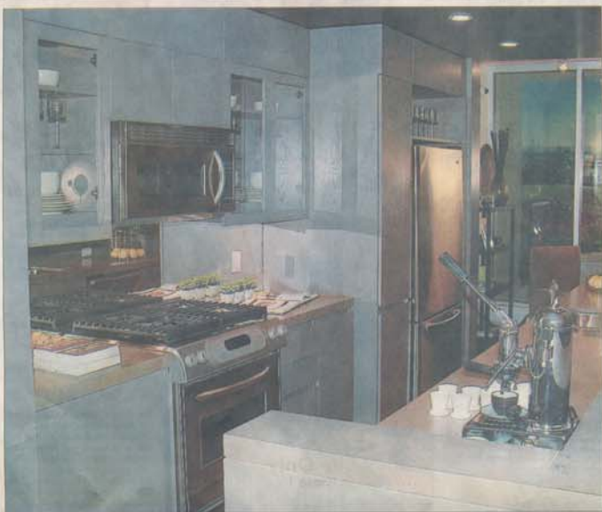
The kitchen of the arriVa show suite has limestone countertops and shimmering stainless steel appliances.